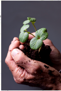
God gave the increase (1 Cor 3:6)

“ CHRISTIANS ARE TO GO FIRST... TEACH FIRST... WITH THE ASSURANCE THAT THE LORD WILL BE WORKING ALONGSIDE US ”