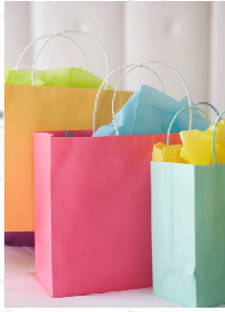
It is more blessed to give than to receive. (Acts 20:35)

“ ... GIVE REGARDLESS OF HOW POOR WE MAY BE OR HOW LITTLE WE CAN GIVE ”