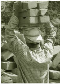
"But why do you call Me 'Lord, Lord,' and do not do the things which I say?" (Luke 6:46)

house was inadequate. When we do the will of God, our foundation will be well laid and we can be confident that heaven will be our home.