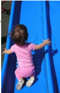
As we have therefore opportunity, let us do good unto all men (Gal. 6:10)

told the Philippians, "I can do all things through Christ which strengtheneth me" (Phil. 4:13). Many local churches struggle due to an inferiority complex. What we need to stop doing is doubting what we can accomplish with God's power. Let us "launch out into the deep."